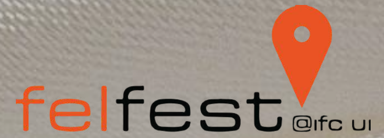
PHOTO AND VIDEOGRAPHY